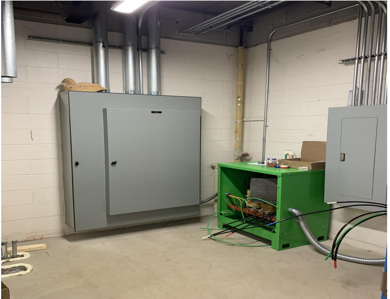
Jr/Sr HS Fitness Center Electrical Transformer and Panel