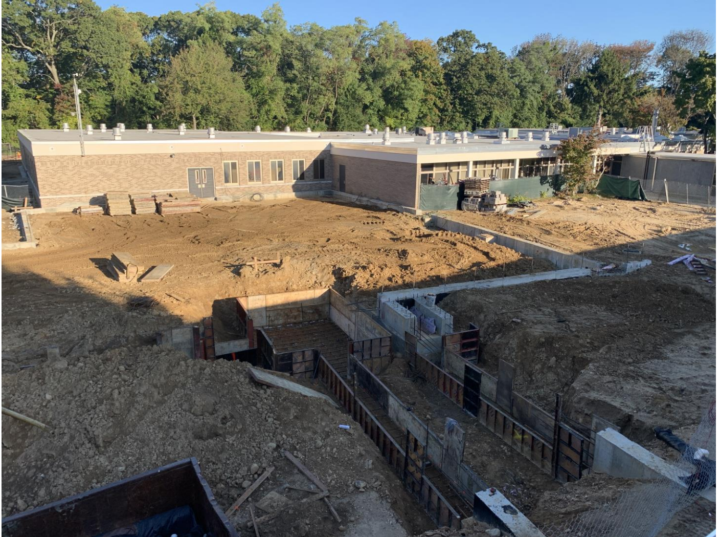
Jr/Sr HS New Addition Foundation Wall Footings