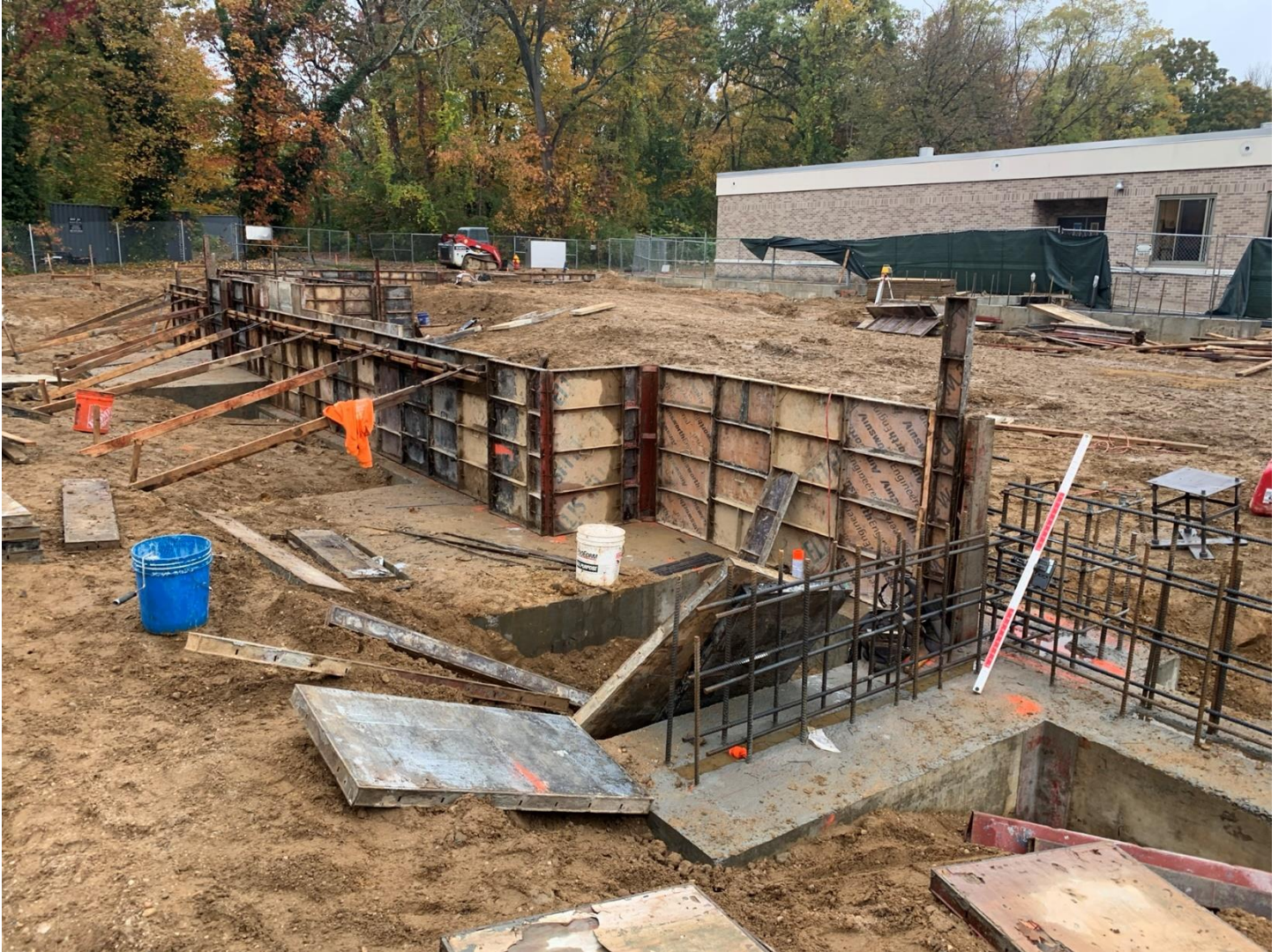
Jr/Sr HS New Addition Foundation Walls