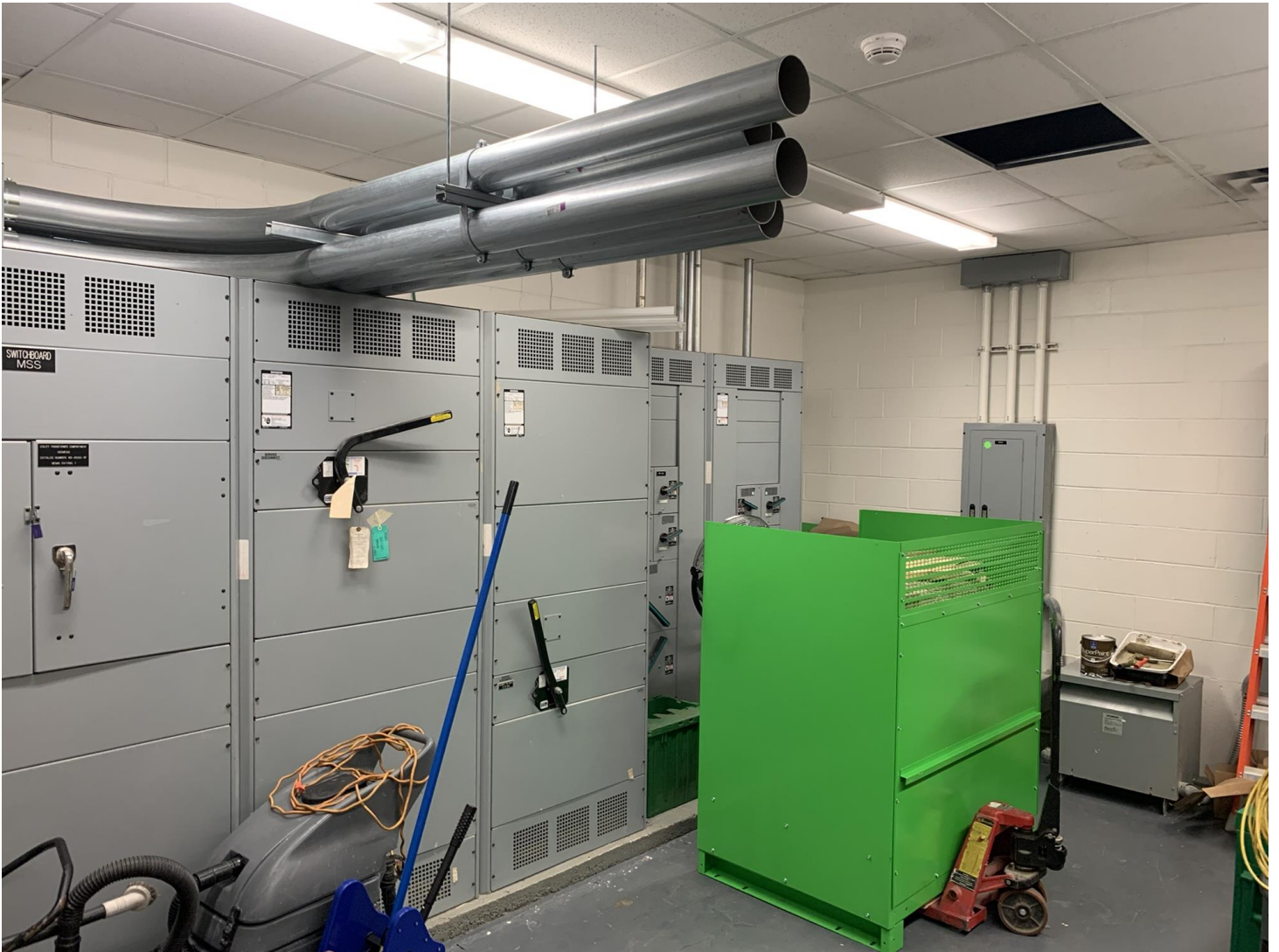
Jr/Sr HS Main Electrical Room Transformer