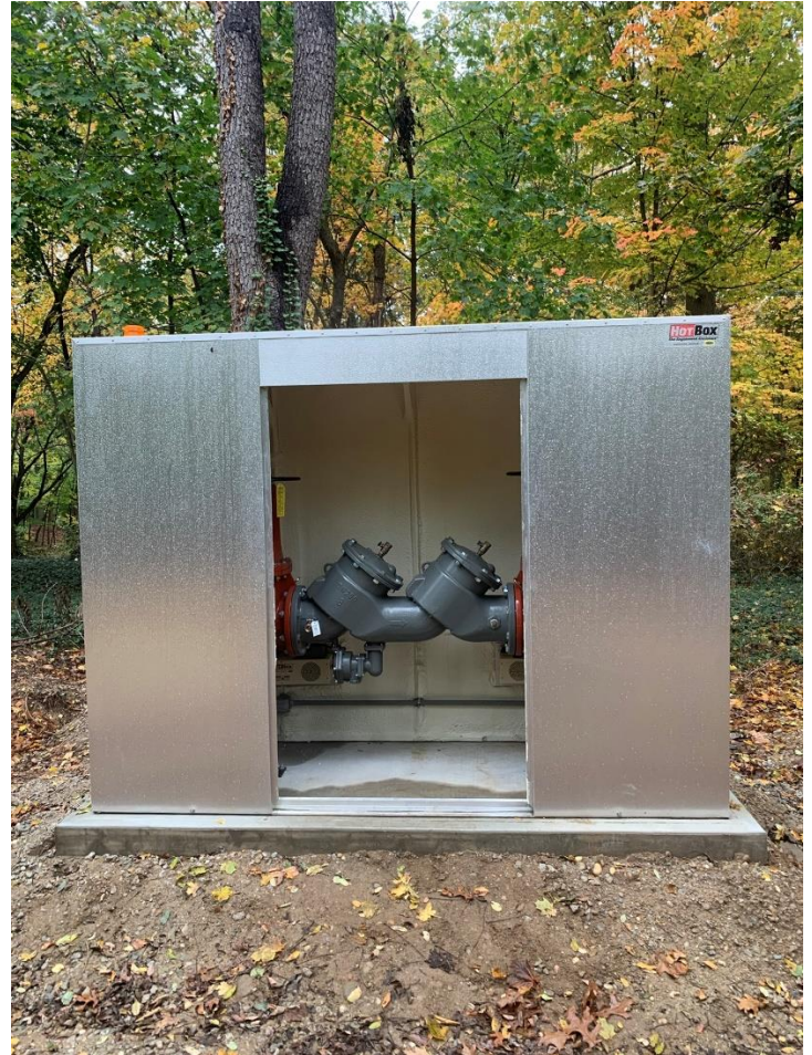
Jr/Sr HS New RPZ and Hot box Installations