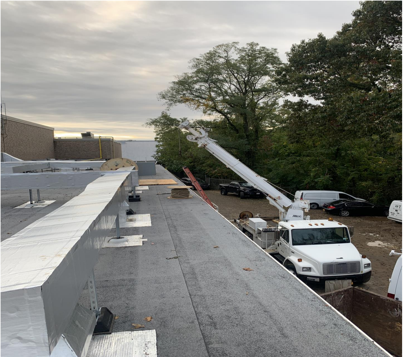
Jr/Sr HS New Addition Electric Service Wiring