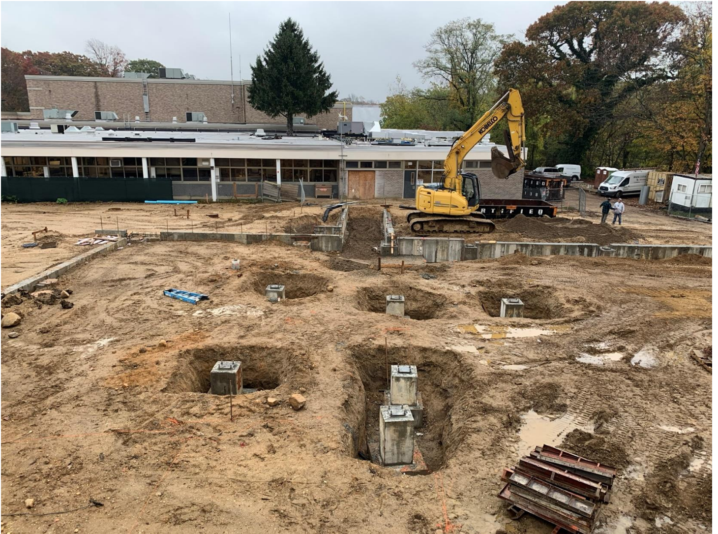
Jr/Sr HS Foundation Piers